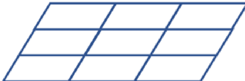
nine copies scale factor = 3