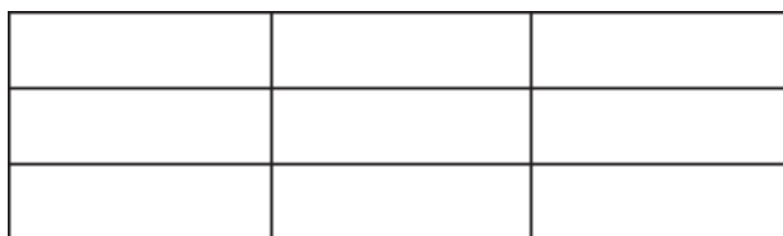
nine copies scale factor = 3